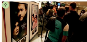
9 going to the movies /'ɡoʊɪŋ tə ðə 'muːvɪz/