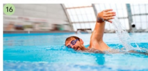
16 swimming /'swɪmɪŋ/