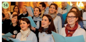
14 singing /'sɪŋɪŋ/