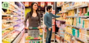
13 shopping /'ʃɒpɪŋ/