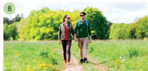
8 going for a walk /'ɡoʊɪŋ fɔː ə wɔːk/