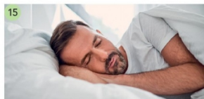
15 sleeping /'sliːpɪŋ/