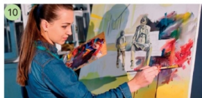
10 painting /'peɪntɪŋ/