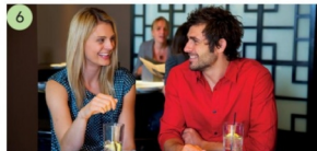
6 eating out /'tiːŋ aʊt/