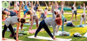
5 doing yoga /'duɪŋ juːgə/