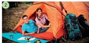
2 camping /'kæmpɪŋ/