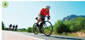
4 bike riding /'baɪk raɪdɪŋ/