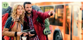
17 traveling /'trævlɪŋ/