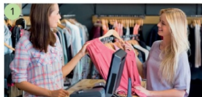
1 buying clothes /'baɪŋ kləʊz/