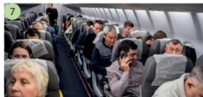
7 flying /'flaɪŋ/