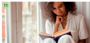
11 reading /'riːdɪŋ/