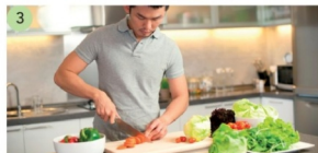
3 cooking /'kʊkɪŋ/