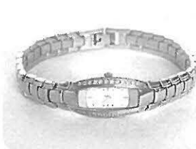
women's watch: $37,400