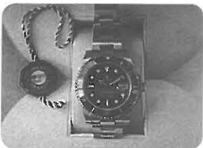
men's watch: $46,570