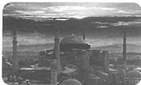
Istanbul: 31 inches of rain

The flight from New York to Miami is shorter than the train trip.