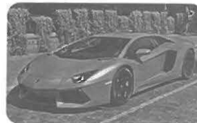
Lamborghini Aventador: 217 mph