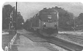
train trip: 1.5 days

The flight from New York to Miami is shorter than the train trip.