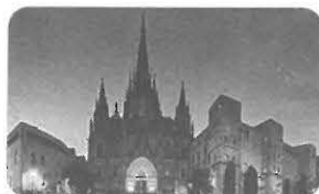
Barcelona: 25 inches of rain