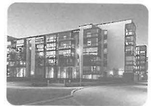
apartment: 7 bedrooms