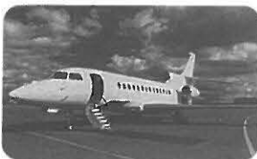
flight New York to Miami: 3 hours