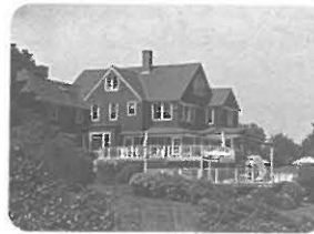
beach house: 10 bedrooms