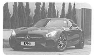
Mercedes AMG S: 186 mph