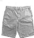
12 sh _ r _ t _ s