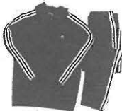
6 tr _ c _ k _ s _ _ t