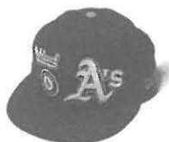
5 c _ p