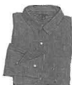
4 sh _ r _ t