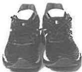
7 sn _ _ k _ _ r _ s