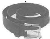
8 b _ l _ t