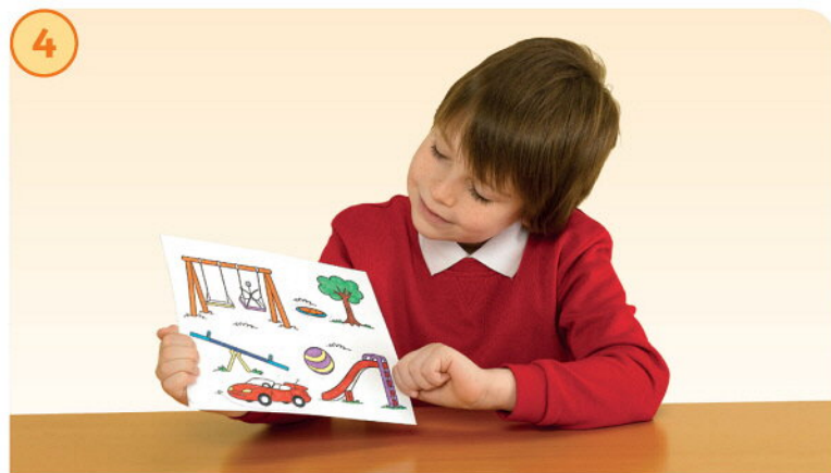
Draw yourself and finish the poster.

3 Speaking Talk about your poster. Ask and answer.