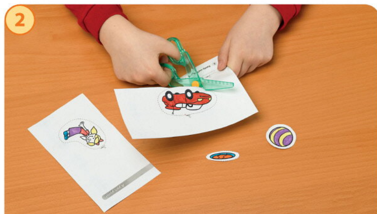
Colour and cut out the pictures.