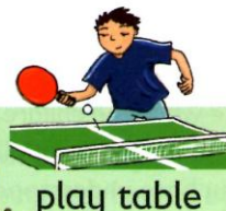
play table tennis