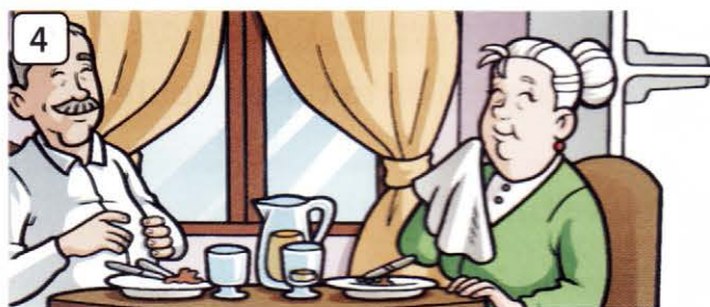
Grandma and Grandpa _____ dinner.