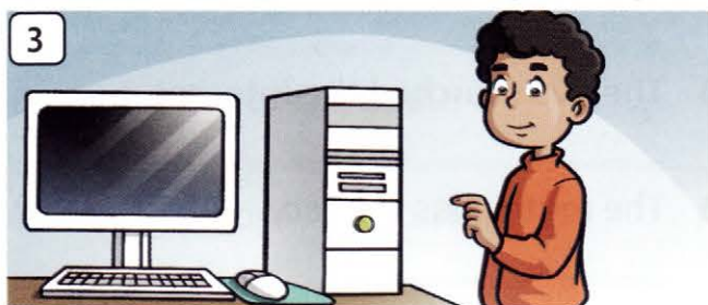
William _____ the computer.