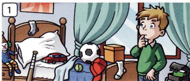
Lewis hasn't put his toys away.

not put make return print not turn on finish