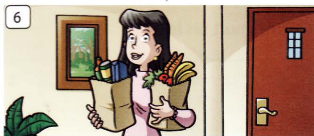
Mum _____ from the shops.