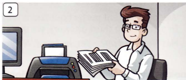
Dad _____ a long document.