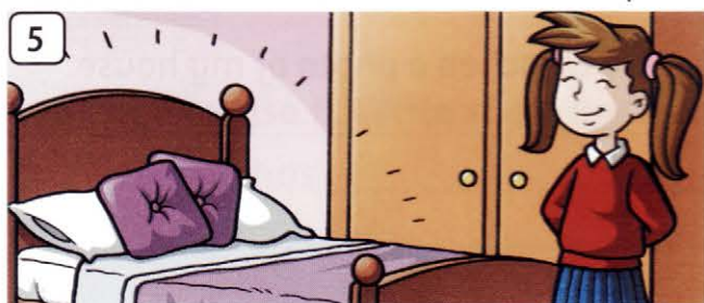
Tina _____ her bed.