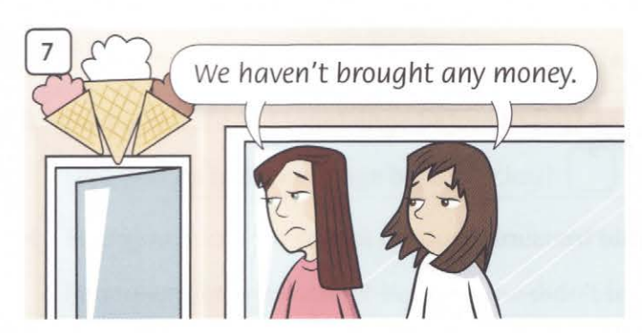
Why didn't the girls buy an ice cream?