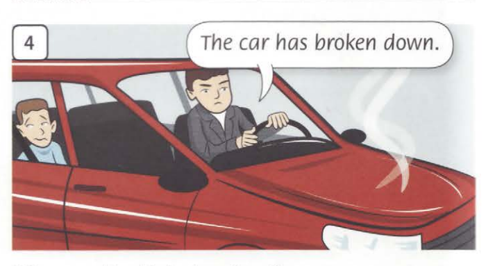
Why was Fred late to school?